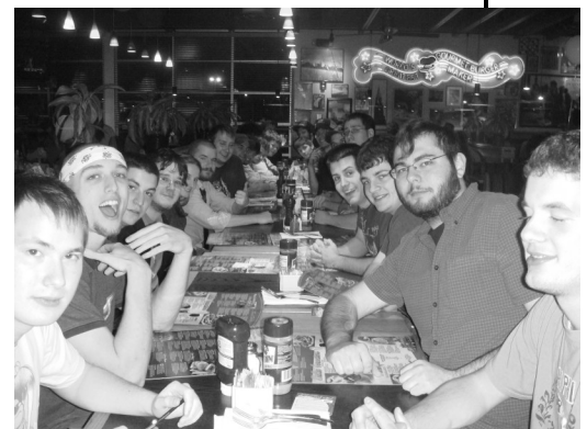
A big group of us at Red Robin