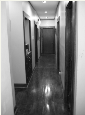
Left: The refinished floor on the first floor of the Annex.