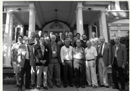
Right: Some of old and new Theta.