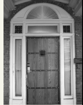
Our new front door. You'd need a cannon to break this thing down.